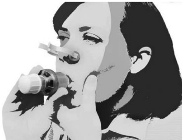
Figure 2 Posture when using the expiratory muscle strength trainer to facilitate an increase in maximum expiratory pressure.

During the training phase of the study, participants were visited weekly at their homes by a clinician. The clinician spent ~20 minutes with the participant during the weekly visit to