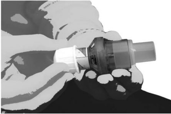
Figure 1 Photograph of expiratory muscle strength trainer used in referenced studies.

participants keep a log of their success. A simple check mark on a form indicated the days they trained and the number of trials they completed each day. Following completion of the treatment arm, participants returned for a postintervention assessment.